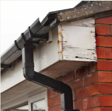
Timber roofline can rot without maintenance...

Freefoam's roofline and rainwater range is different. An occasional wipe down with washing-up liquid and water does the trick.