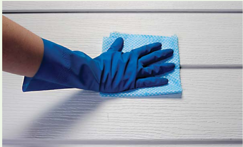
...but a quick wipe down will keep your roofline and cladding looking good.

Goodbye to time-wasting maintenance and hello to free weekends!